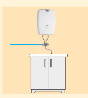
POW.G-10 Luna with a tap