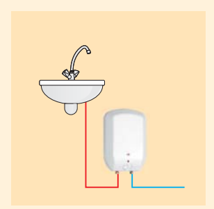
POC.G-5 Luna inox (connect it to a any tap mixer)