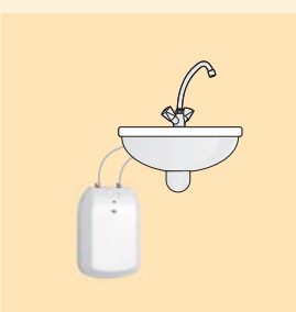
POC.Db-5 Luna inox with a tap mixer