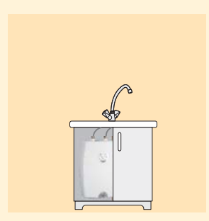
POW.D-10 Luna with a tap