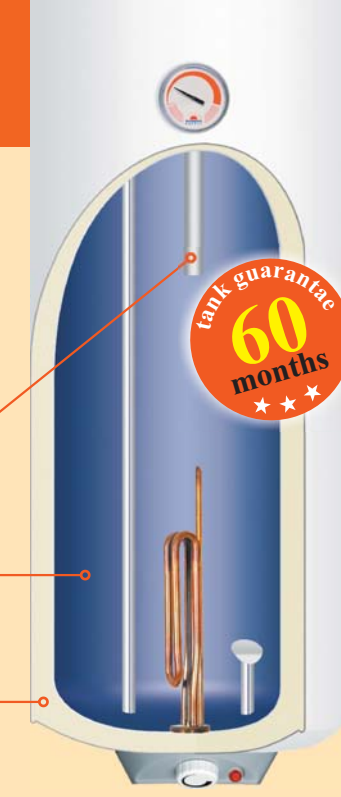
depth 36 cm only

The thermal isolation, made of thick polyurethane, minimalizes the thermal loss.